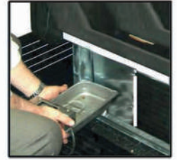
PULL OUT EVAP PAN FOR EASY CLEANING ON SELF CONTAINED