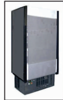
PULL DOWN NIGHT CURTAIN