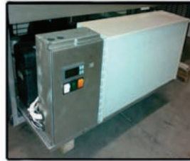
PULL OUT CONDENSING UNIT